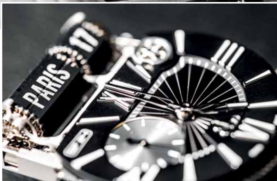
From top: Inside Jacob & Co's Geneva workshop, which opened in 2012; Interior workings of the Epic SF24; Launched in 2014, the Astronomia Tourbillon is Jacob & Co's most ambitious timepiece.