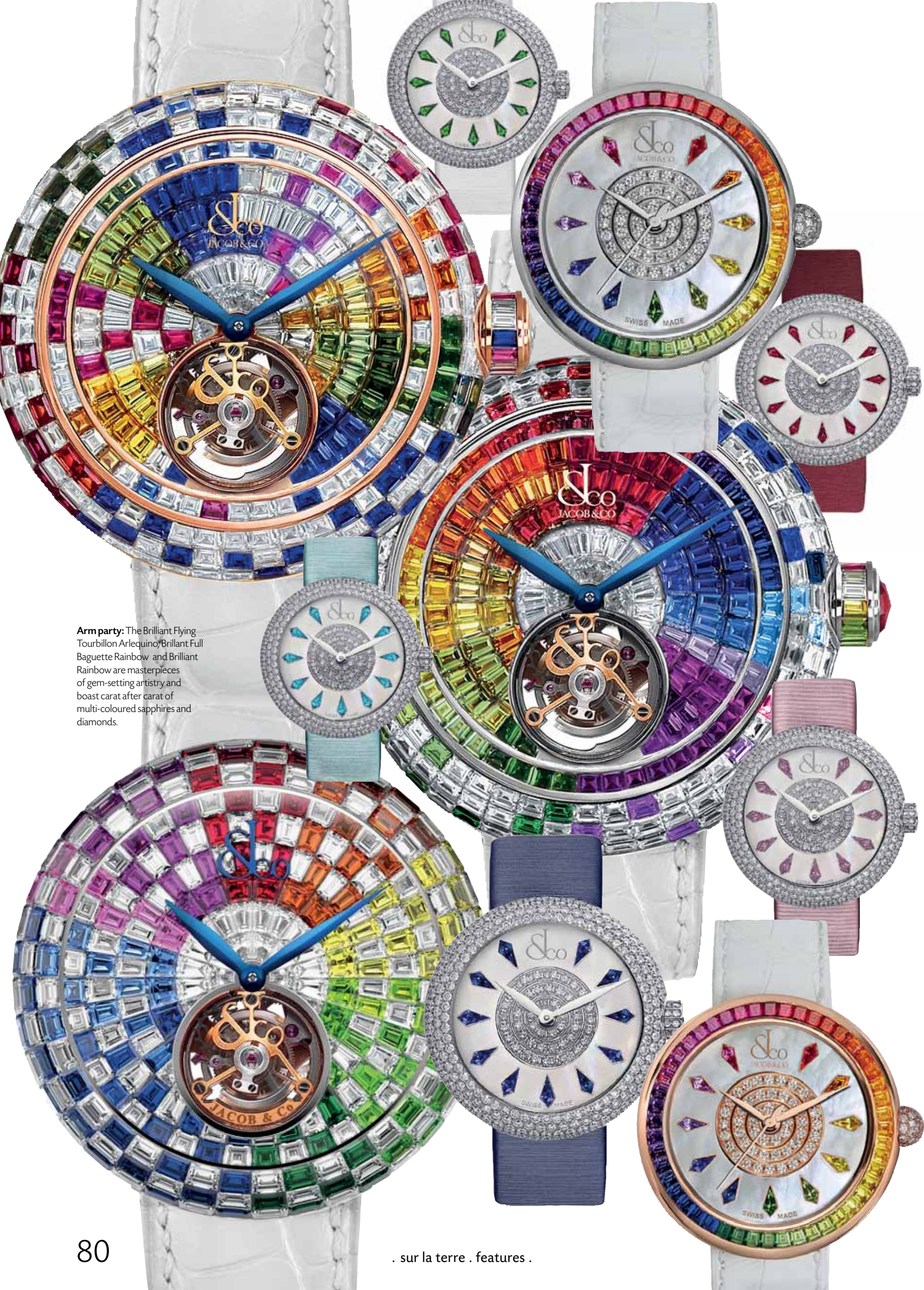
Arm party: The Brilliant Flying Tourbillon Arlequino, Brilliant Full Baguette Rainbow and Brilliant Rainbow are masterpieces of gem-setting artistry and boast carat after carat of multi-coloured sapphires and diamonds.