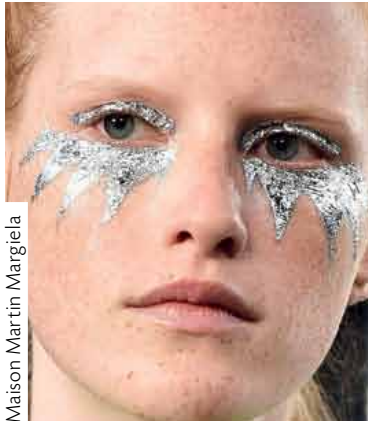
Maison Martin Margiela