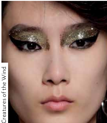
Creatures of the Wind