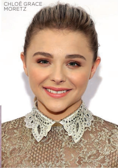
CHLOË GRACE MORETZ

FROM TOP: ESTÉE LAUDER LITTLE BLACK PRIMER, $27, DRUGSTORES, SEPHORA COLLECTION DISPOSABLE MASCARA WANDS, $9, SEPHORA.CA, RODIAL GLAMOLASH SKINNY MASCARA, $29, MURALE.