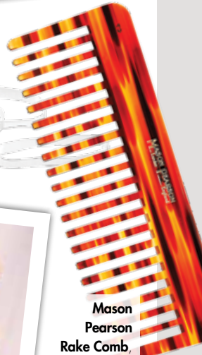
Mason Pearson Rake Comb, $33, ebeauty.ca