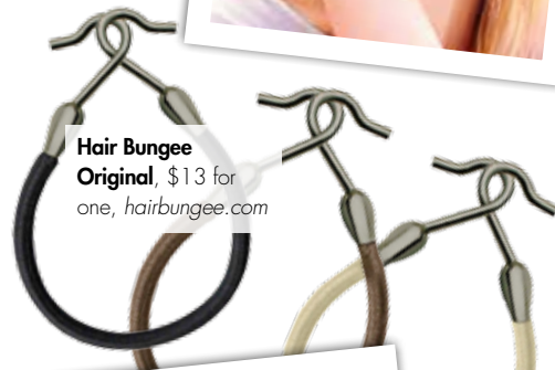
Hair Bungee Original, $13 for one, hairbungee.com