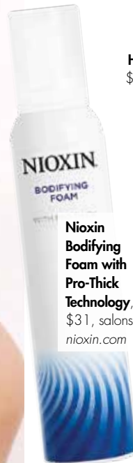
Nioxin Bodifying Foam with Pro-Thick Technology, $31, salons, nioxin.com