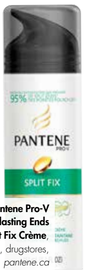
Pantene Pro-V Everlasting Ends Split Fix Crème, $8, drugstores, pantene.ca