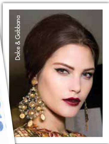
Femmes fatales Miranda Kerr (far left) and Lea Michele (left) know the pièce de résistance of a killer ensemble is a pucker painted a sultry shade of purply red.