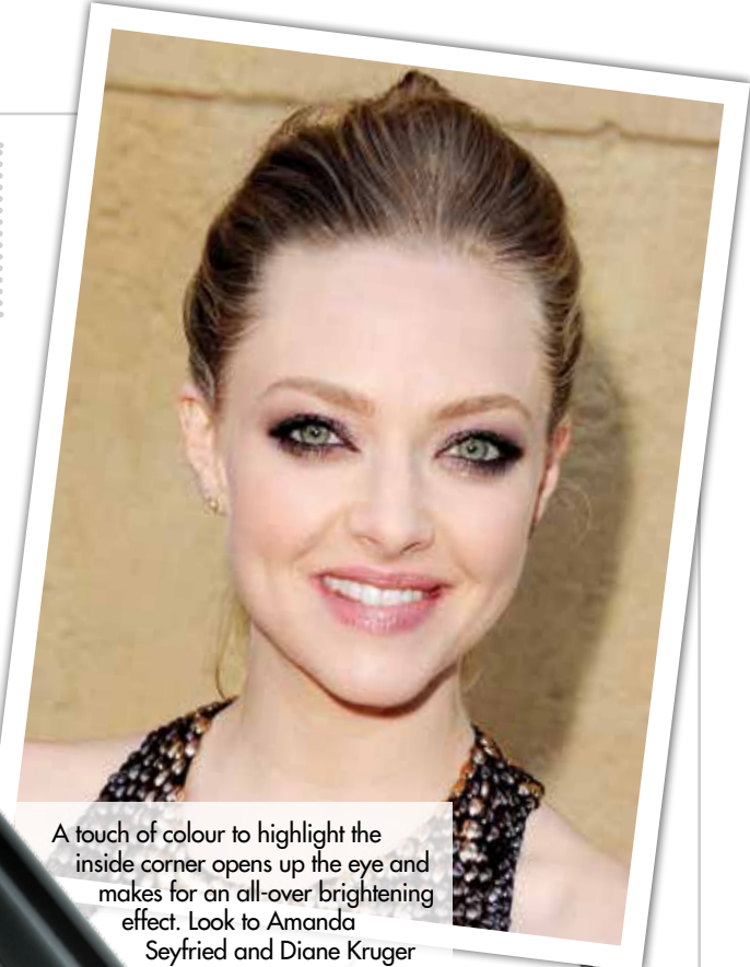
A touch of colour to highlight the inside corner opens up the eye and makes for an all-over brightening effect. Look to Amanda Seyfried and Diane Kruger (far left) for inspiration.