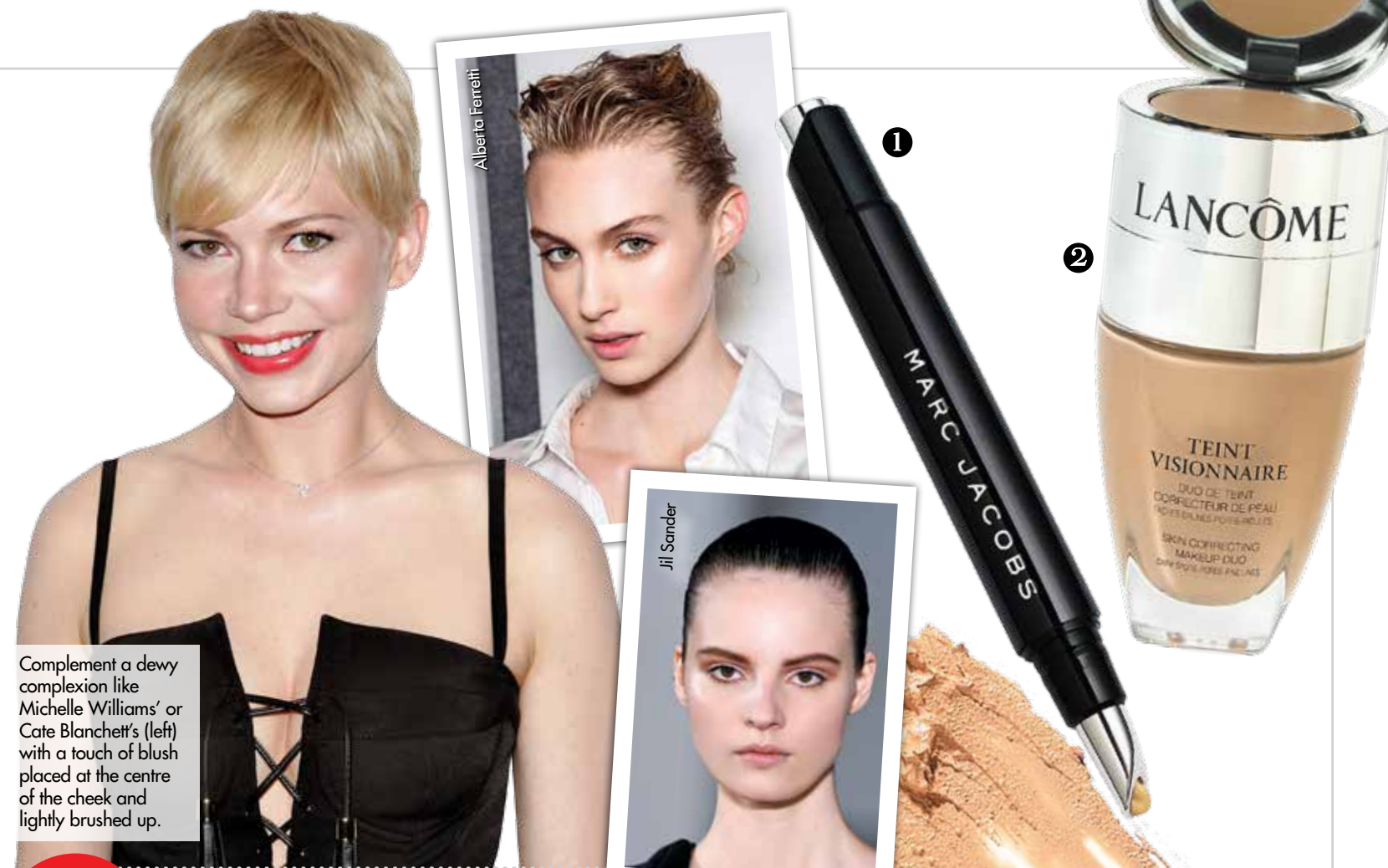
Complement a dewy complexion like Michelle Williams' or Cate Blanchett's (left) with a touch of blush placed at the centre of the cheek and lightly brushed up.

Think you need a sponge or brush to apply your foundation? Skip it! Warm up the formulation with just your bare hands, using your fingertips as activators.